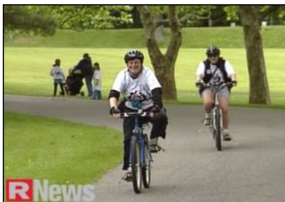
Ride attracts avid and leisure riders